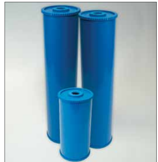
4.5" CARTRIDGE REPLACEMENT KIT