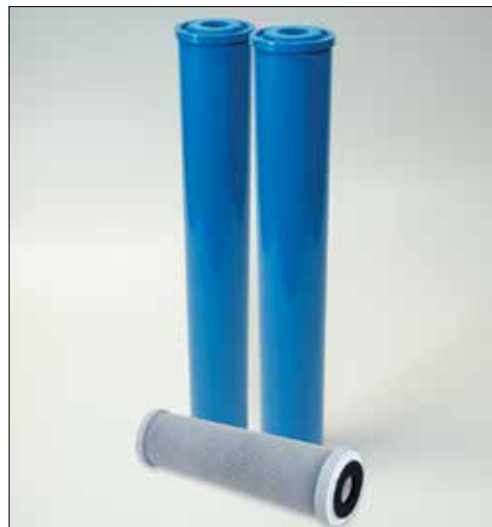
2.5" CARTRIDGE REPLACEMENT KIT